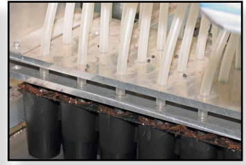
compatible for different tray types