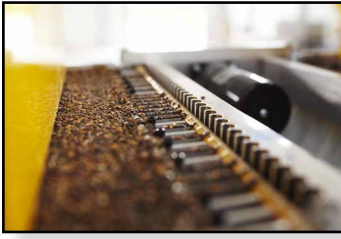
single, double or triple sowing possible