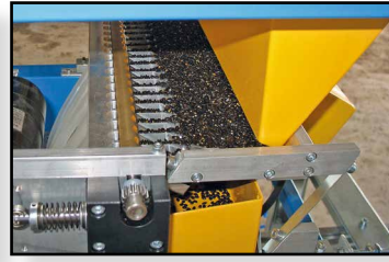
seed spillage is collected in seed containers below