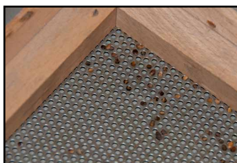
screen with round holes