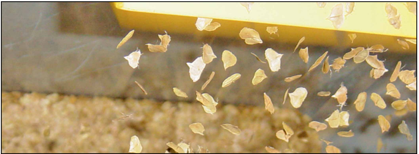
aspiration channel removes light particles