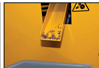
seed lot is sized into 3 fractions