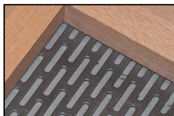
screen with oblong holes