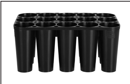
outer dimension: 352x216mm