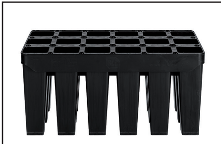
outer dimension: 352x216mm