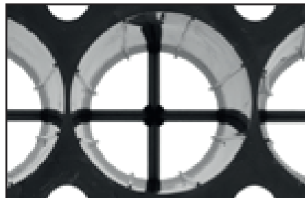
root guiding rib