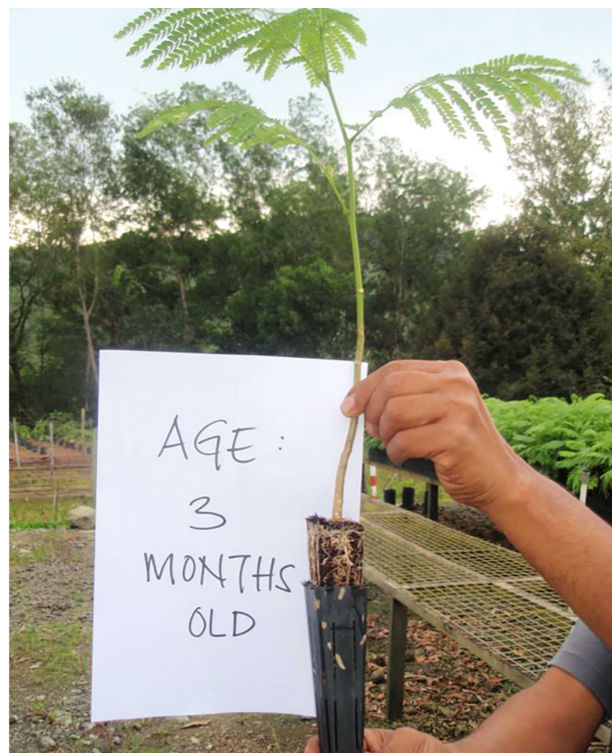
Albizia, Sabah (East Malaysia)

Using one frame with the same outer dimensions (567mm 375mm) allows the nursery man to decide on one handling system within the nursery, and also allows for easier mechanisation of operations. Each insert is supported in the frame by eight stubs which allow for proper ventilation through the frame and canopy of the seedlings. This ensures effective air pruning in sideslit cells and drying of the canopy after irrigation applications.