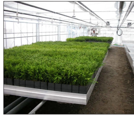
Japanese Cedar (cuttings in greenhouse)