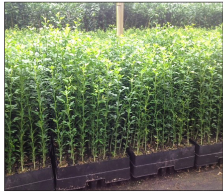
Citrus, New Zealand