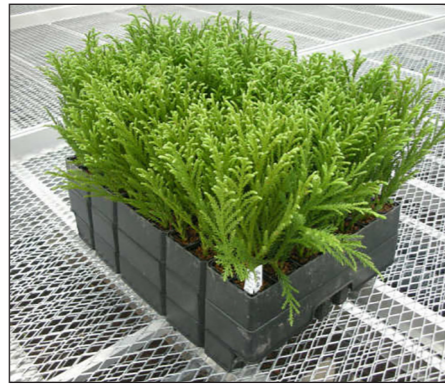
Japanese Cedar (ready for despatch)