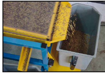
sizing of a wide range of seed species