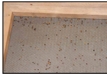
screens in various sizes