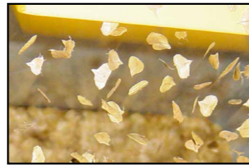
seed and waste material are collected in separate boxes